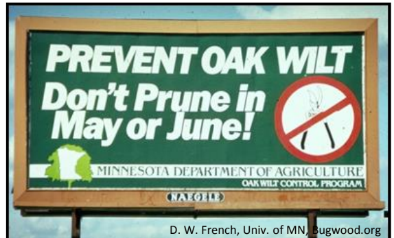
D. W. French, Univ. of MN, Bugwood.org

Counties having at least one oak wilt infestation. Oak wilt is widespread and locally common in Lower Michigan, southern Wisconsin and the Twin Cities region of Minnesota, but still uncommon and local north of these areas. (Compiled from MI, WI and MN DNR data)