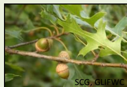
Pin or scrub oak

Red and black oaks are easily recognized by their pointed, bristle tipped leaf lobes. Their bark is often smooth when young but deeply furrowed with age. Their acorns ripen the second year, leaving them attached to the year-old twigs below the leaves.