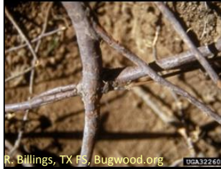
R. Billings, TX FS, Bugwood.org UGA322602

Red and black oaks often form root grafts with the same or closely related species. Grafts between white oaks are less common.