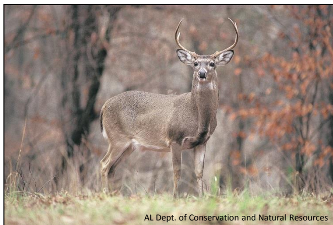
AL Dept. of Conservation and Natural Resources

An insidious disease is killing mitigomizh (oaks) from Texas to Minnesota and east to New York. Oak wilt (OW for short) is caused by the fungus Ceratocystis fagacearum . This fungus infiltrates oak trees, clogging the tree's water conducting system and causing the leaves to develop brown blotches and drop in summer. Red oaks are most susceptible to OW and are almost always killed. White oaks are much more resistant but can still die from OW.