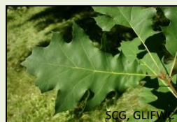
Northern red oak