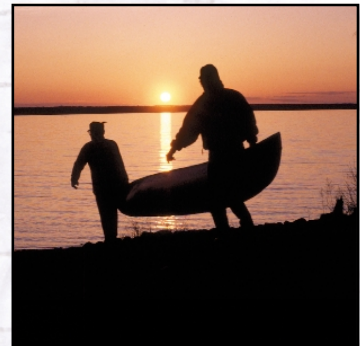
Public lands within the ceded territories provide Ojibwe people with limited harvest opportunities.