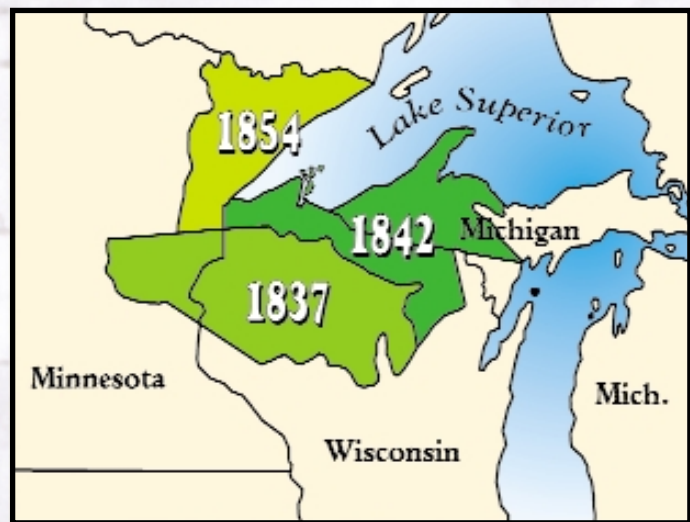
Ojibwe land ceded to the United States through the treaties of 1837, 1842 and 1854.

Five years later, Ojibwe headmen and government representatives agreed upon a 10-million-acre land cession that included portions of northern Wisconsin and Upper Michigan. The treaty opened the south shore of Lake Superior to lumberjacks, along with iron and copper miners. Similar to the previous 1837 arrangement, the 1842 Treaty guaranteed the Ojibwe's hunting, fishing and gathering rights and promised annuity distributions.