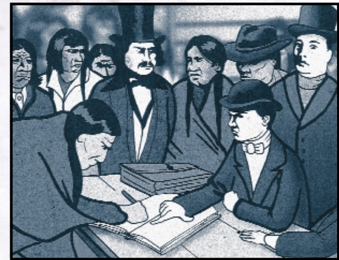
Annuity payment at Sandy Lake Indian Sub-Agency, 1850.